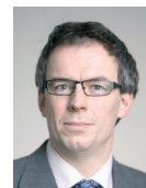
David Owens Department of Finance Representative of the Minister for Finance